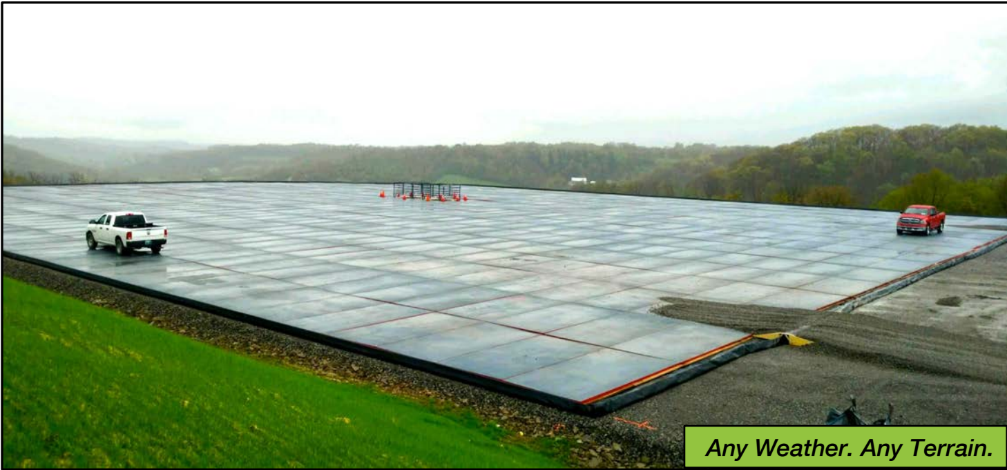
Any Weather. Any Terrain.