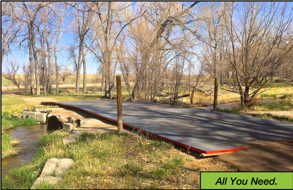
All You Need.